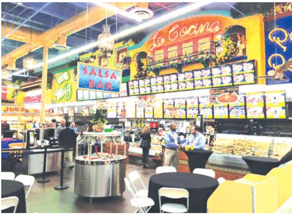
The new Vallarta Market in Downey at the former Beaches Market site in Bakers Square on Imperial Hwy.