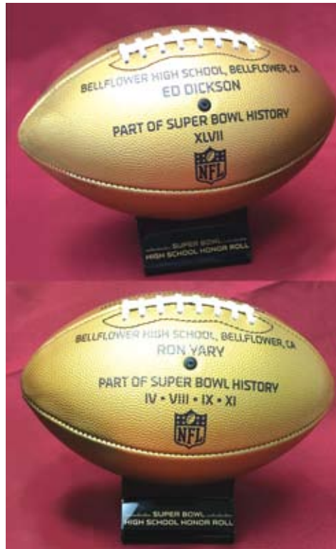
Bellflower High School is displaying two Golden Footballs in honor of NFL greats Ron Yary and Ed Dickson, who graduated from the high school in 1964 and 2004, respectively.

As part of the NFL's High School Honor Roll initiative, high schools honored will also receive a new character education curriculum and the opportunity to apply for grants of up to $5,000 to support their football programs.