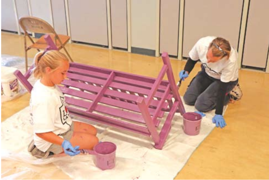
Love La Mirada participants paint benches at Dulles Elementary School in La Mirada. Projects included painting and cleaning up local parks, making improvements at schools, writing letters to veterans, and visiting with seniors.