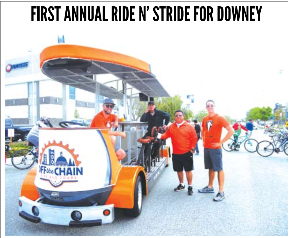
Off the Chain from Sacramento came down to participate as the official party bike.