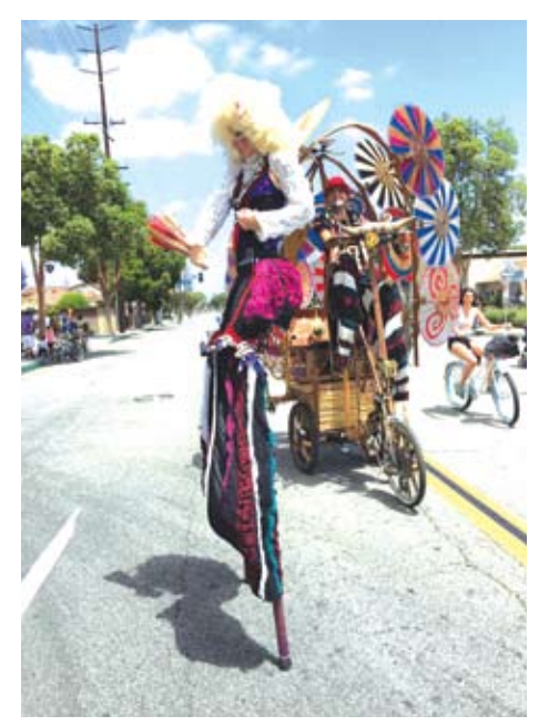
One of the performers along the route on six-foot stilts.

The city of Downey held their first CicLAvia event as part of a May Day celebration. The new Ride N' Stride 2016 was a huge hit with area residents. In 2010 CicLAvia took over the streets of Los Angeles, challenging the notion that you can only get anywhere in Southern California in a car. CicLAvia temporarily removed cars and closed down certain streets to encourage noon-motorized transit for pedestrians, bicycles, skateboards, rollerblade, and wheelchairs. The initial idea was to promote good health, and to engage residents to communicate with each other. The immediate success inspired other communities to research the transportation landscape of Los Angeles in a completely different way. CicLAvia's goal was to help local cities 'reimagine' our neighborhoods, businesses, and lifestyles, through alternative transportation. Since 2010, hundreds of thousands of people have freely participated as CicLAvia temporarily transforming nearly 100 miles of city streets into a large urban park and community oasis. Sunday, May 1, 2016 over 5 miles of Downey Streets were completely closed to vehicular traffic. Along the route were various forms of music, games, vendors, and entertainment. The five mile route spread across the streets of Columbia Way, Imperial Hwy, Alameda Street, Stewart & Gray, Lakewood, La Reina Avenue and downtown Downey at 3rd Street. A shuttle service was available at all city parks and several pre designated pick up and drop off point