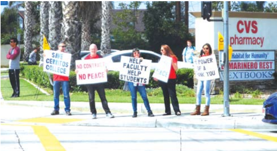
Cerritos College students and staff rally in front of the college.