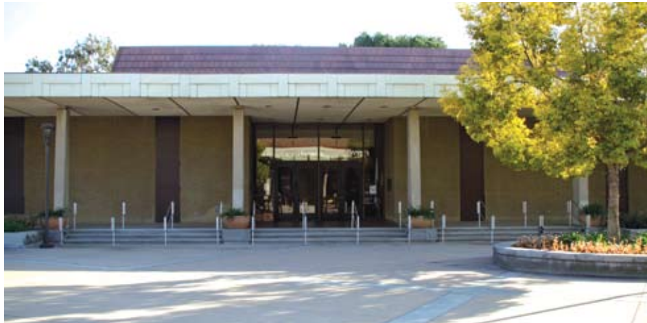
UPGRADE: Built in 1969, the La Mirada Library will receive upgrades as part of a project between the City of La Mirada and Los Angeles County.

The La Mirada City Council recently approved agreements with the County of Los Angeles to enhance the La Mirada Library.