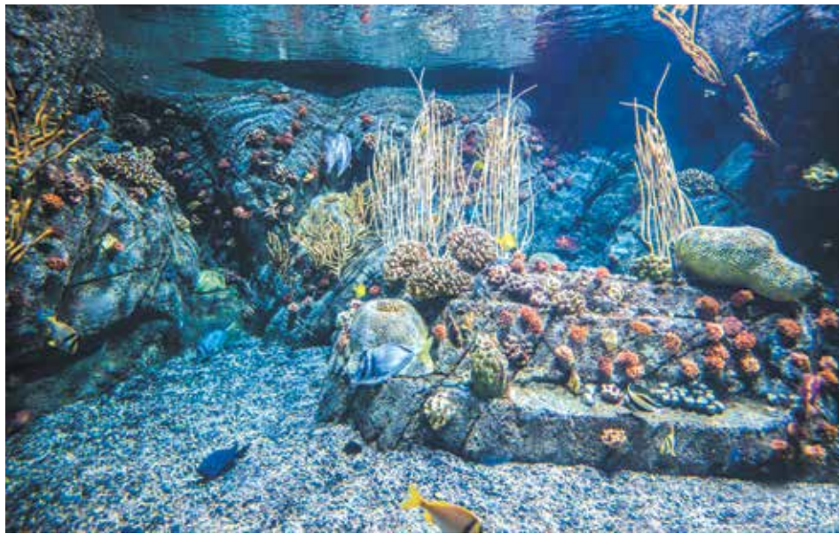
REVAMP: The Southern California Gallery is among ten new exhibits based on aquatic life along the California coast and Catalina Island.