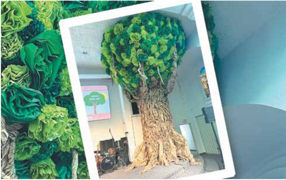
INTERGENERATIONAL MINISTRY: this year's theme is Tree Tales, featuring Jer. 17:7-8, it coordinates with a 10-week summer sermon series of the same name.

The Rosewood Christian Reformed Church in Bellflower has put on Summer Fun Nights, a five-week Wednesday night intergenerational ministry for over 21 years.