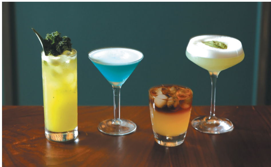
SHOR BAZAAR MOCKTAILS: (l-r) Kale Smash, Blue Ice, Mai Tai, Melon Sour.