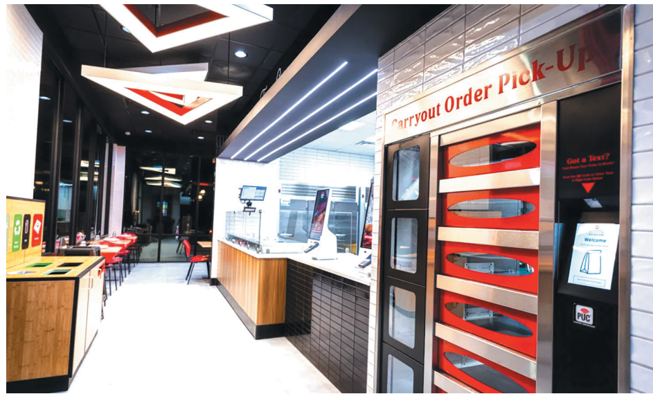
THE NEW DESIGN has heated cabinets for pick-up orders and a front-facing pizza making counter. The exterior has a drive-thru lane serving a new "Hut 'N Go" menu.